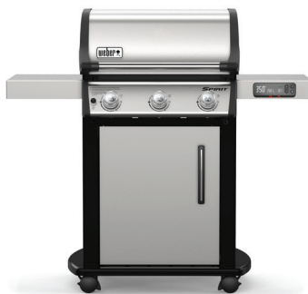
SPIRIT® SMART GRILL SX-315