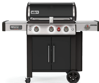
GENESIS® II SMART GRILL EX-335

12,000 BTU-per-hour input side burner 9,000 BTU-per-hour input Sear Station burner LP: 61016601 | MAP: $1,199.00