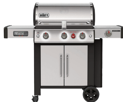
GENESIS® II SMART GRILL SX-335

12,000 BTU-per-hour input side burner 9,000 BTU-per-hour input Sear Station burner LP: 61016601 | MAP: $1,199.00