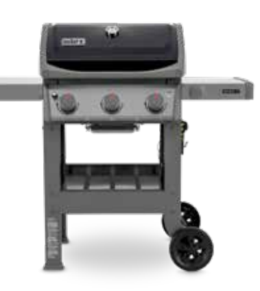
SPIRIT° II E-310