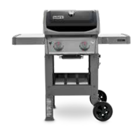
SPIRIT° II E-210