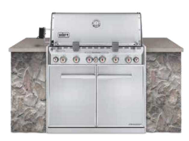
SUMMIT° S-660 BUILT-IN