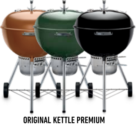
ORIGINAL KETTLE PREMIUM