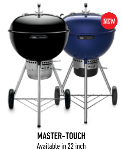
Master-Touch <sup>®</sup> Series