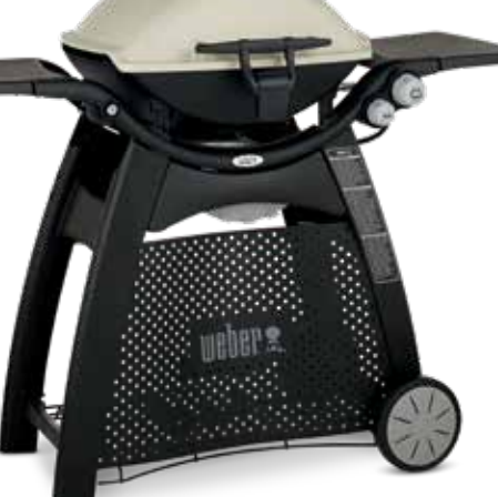
WEBER Q 3200 GAS GRILL