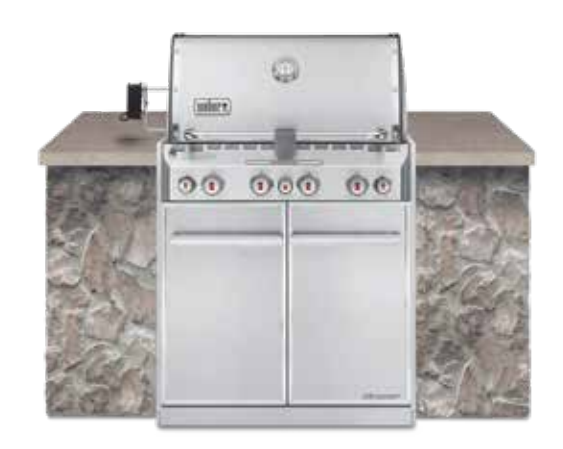
SUMMIT® S-460 BUILT-IN