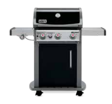
SPIRIT® E-330 + Sear Station and Side Burner