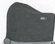
Fits Summit® Charcoal Grilling Center