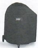
Fits Summit® Charcoal Grill