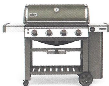
SMOKE LP: 62050201