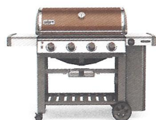
COPPER LP: 62020201