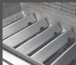
STAINLESS STEEL FLAVORIZER® BARS