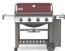
CRIMSON LP: 62030201