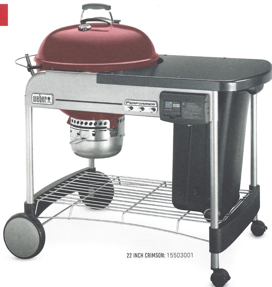
22 INCH CRIMSON: 15503001