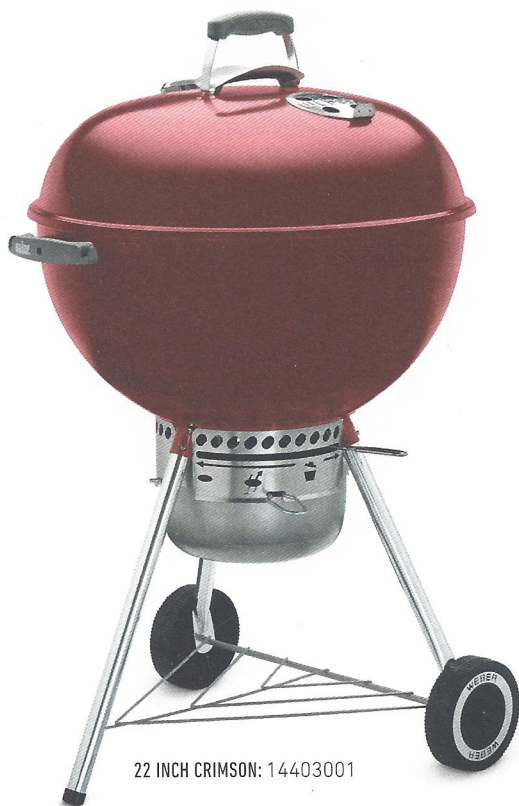
22 INCH CRIMSON: 14403001